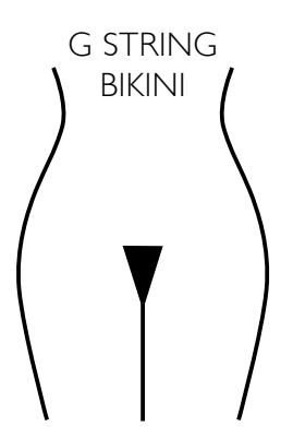
A high bikini wax that removes some hair underneath following the line of a g-string.